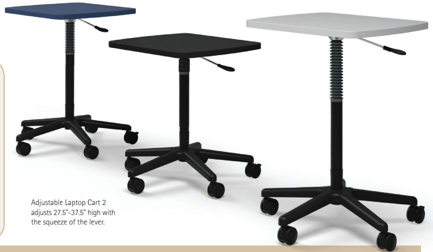
Adjustable Laptop Cart 2 adjusts 27.5"-37.5" high with the squeeze of the lever.

Colors: Base and column are black; top available in Black, Bluestone, and Fog.